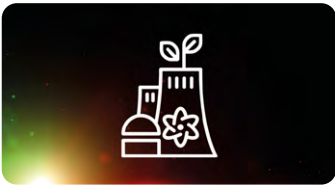
Master's in Nuclear Energy