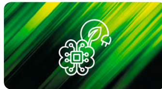
AI for Smart Energy certificate programme