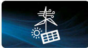
Master's in Renewable Energy