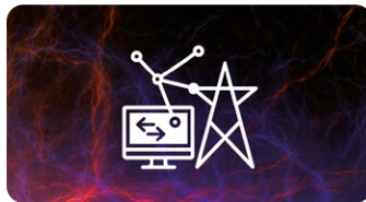
Master's in Smart Electrical Networks and Systems