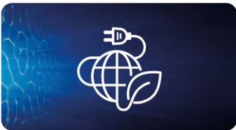
Master's in Sustainable Energy Systems