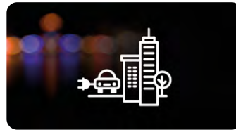
Master's in Energy for Smart Cities